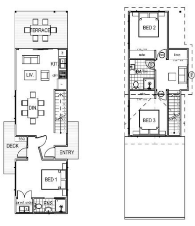
B&B - 3 Bedroom