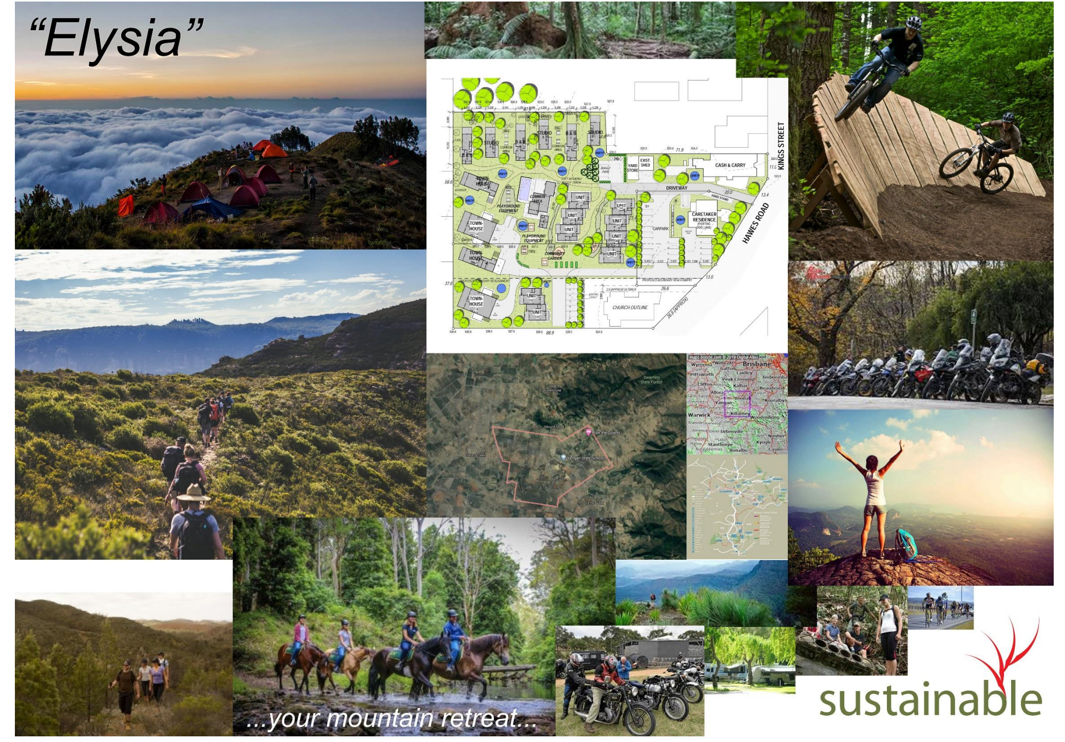
YCC – Elysia "Your Mountain Retreat"