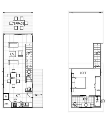
Studio - 1 Bedroom