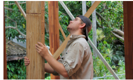
FINGAL HEAD 'THE HIDDEN GEM' HOME CUSTOM DESIGN