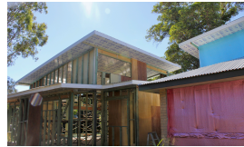
CAMP MOUNTAIN 'DAY' HOME RETROFIT JOURNEY