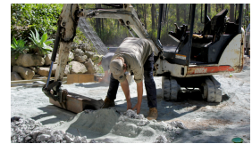
CAMP MOUNTAIN 'KILBY' HOME LANDSCAPING